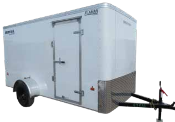
MODEL SHOWN: LT SERIES 6' X 12'

The LT Series Cargo Trailer is a great economy-priced trailer that utilizes construction grade upgrades.