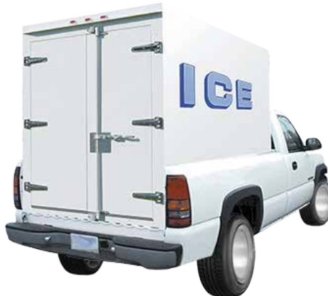
MODEL SHOWN: 5' X 8' TRUCK BODY