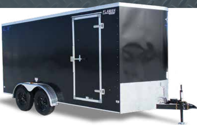
MODEL SHOWN: LTV SERIES 6' X 14' W/ V-NOSE