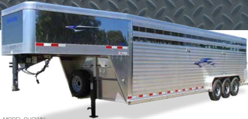
MODEL SHOWN: TRAVALUM 28' GOOSENECK