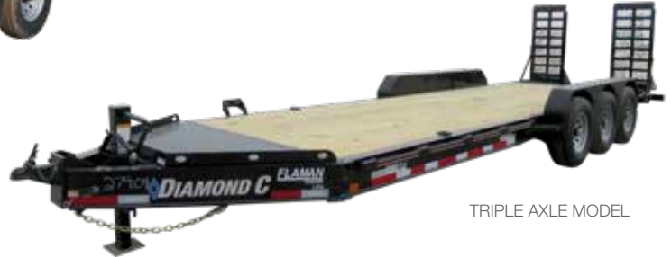
TRIPLE AXLE MODEL