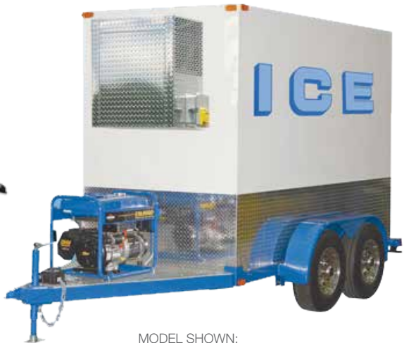
MODEL SHOWN: POLAR EXPRESS SUPER-SIZED 5' X 10'