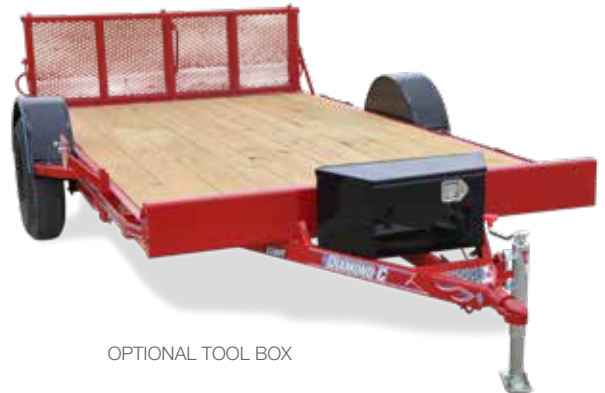
OPTIONAL TOOL BOX