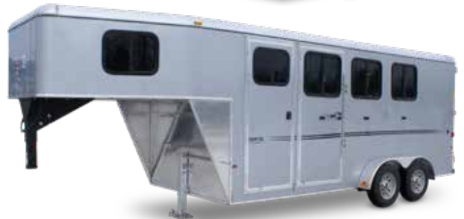
SHOWN WITH OPTIONAL WINDOW IN GOOSENECK