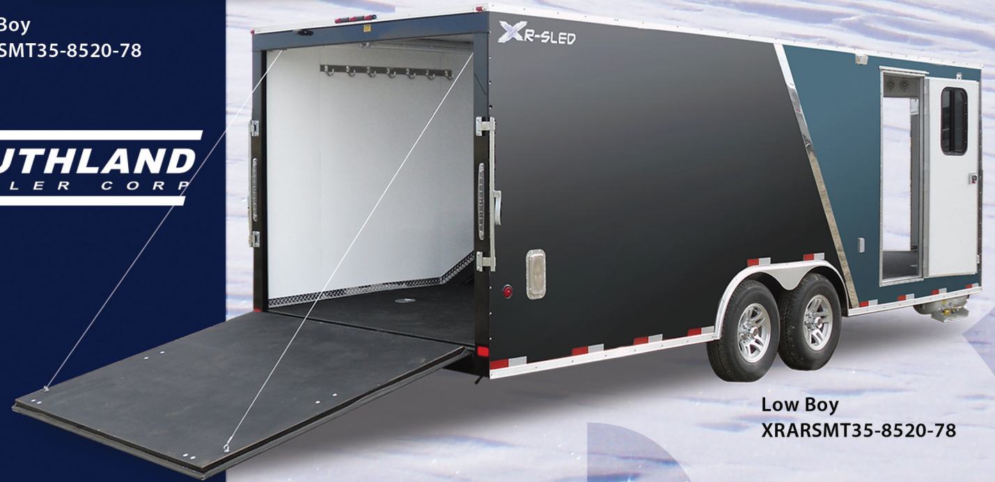
Low Boy XRARSMT35-8520-78