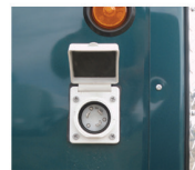
120 VOLT SHORELINE