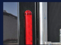
L.E.D. TAIL LIGHTS