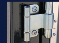
GALVANIZED HEAVY DUTY DOOR HINGES