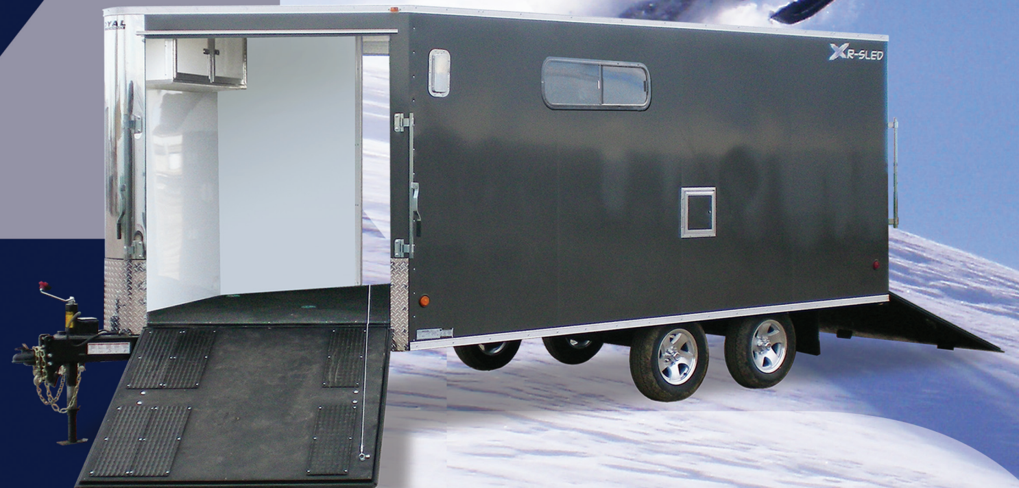
High Boy XRARSMT35-8520-78