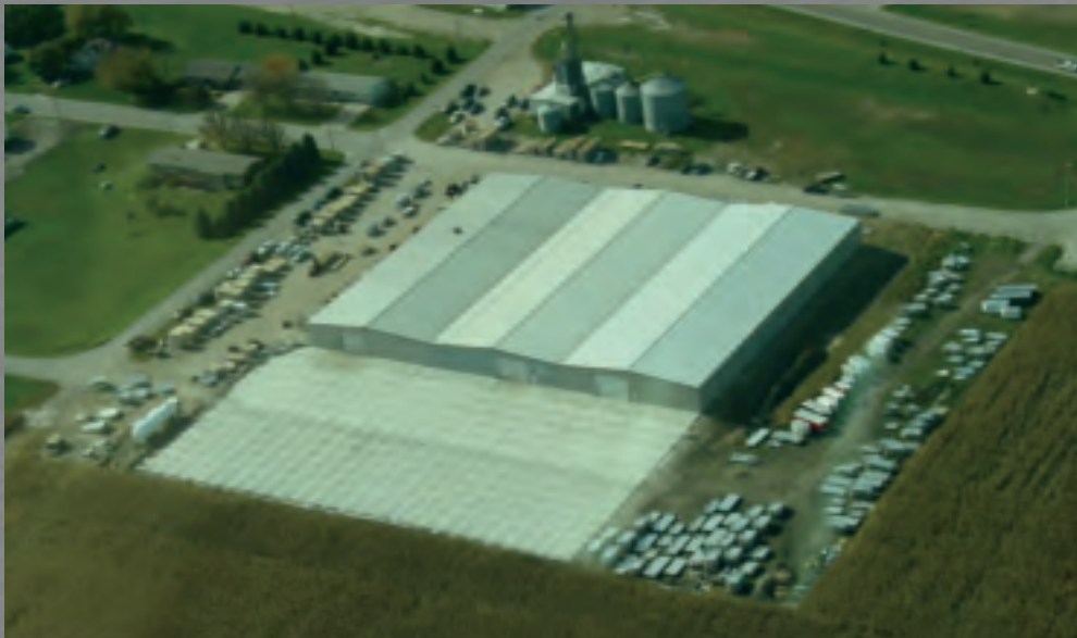
Aerial view of Aluma factory