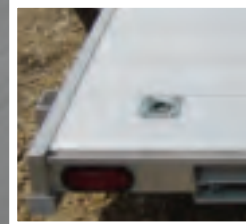
Stainless Steel Recessed Tie Rings All Models