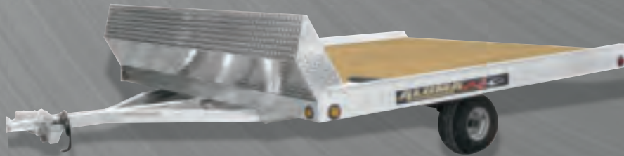
shown w/optional salt shield