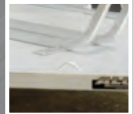
Motorcycle Brackets All Models