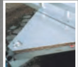
Front Storage Box 641-7800-8200 Series