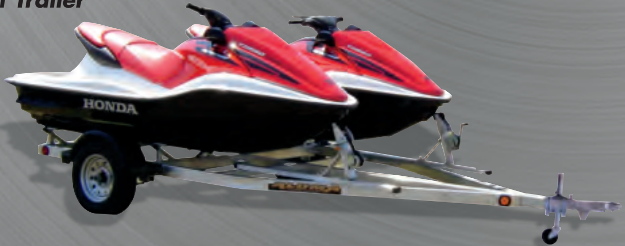
PWC2 Two-Place Watercraft Trailer