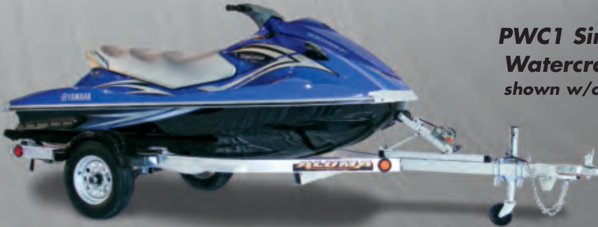
PWC1 Single Place Watercraft Trailer shown w/optional jack