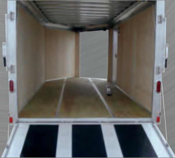
Enclosed Snowmobile Trailer Interior