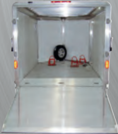
shown with optional spare tire, spare tire mount and upgraded Lock N Load wheel chocks