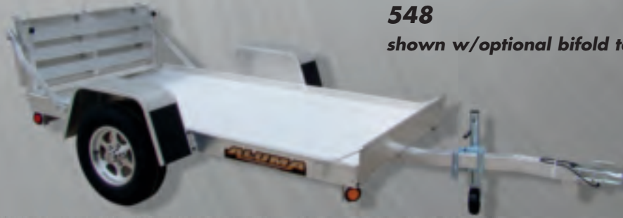
548 shown w/optional bifold tailgate and jack