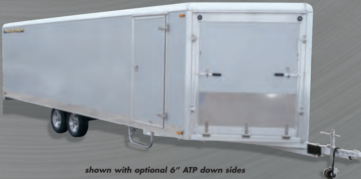
shown with optional 6" ATP down sides