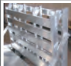
Bifold Tailgate All Models