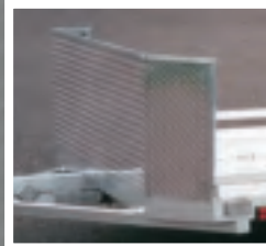
Aluminum Rock Guard All Models