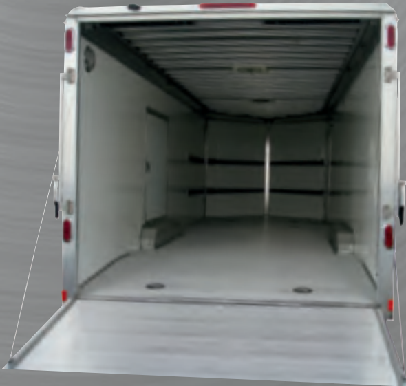
AER Inside Trailer

shown with optional E-Trac, white lining upgrade on walls, and 48" escape door