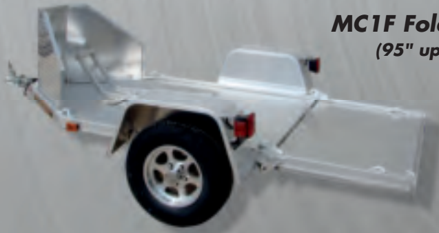
MC1F Folding (95" upright)