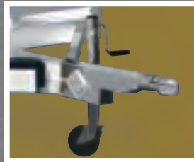
Swivel Jack 1200# Capacity