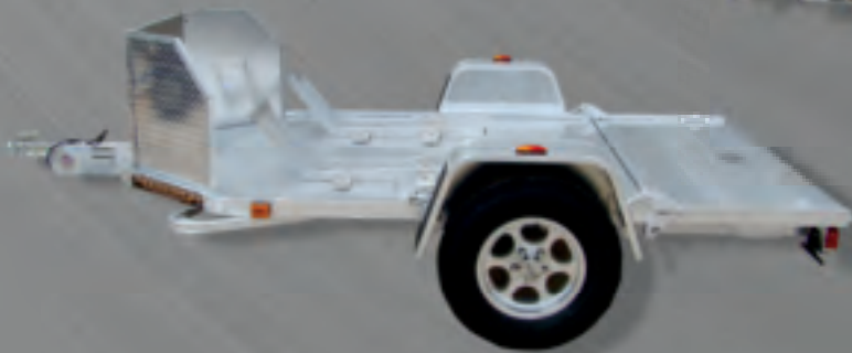
MC2F Folding (89.5" upright)