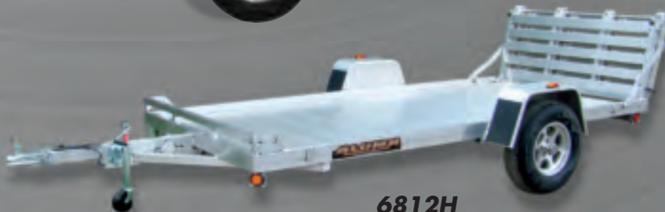
shown w/optional bifold tailgate