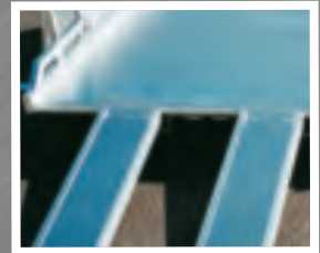
Ramps 7800-1020 Series