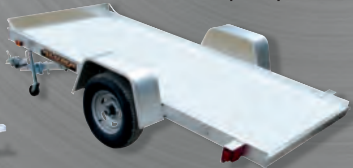
5410T shown w/optional jack