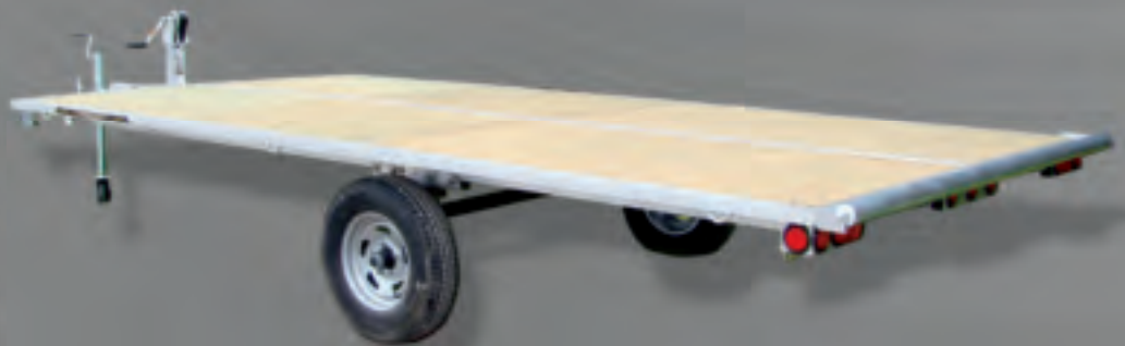
8414 RT Raft Trailer